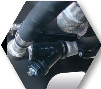
Built In "Y" Fluid Strainer